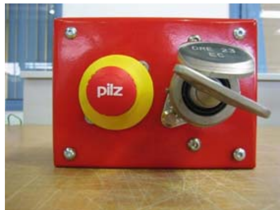
Captive key systems: The key can not be removed unless it is in the off position. The same key is used to unlock the access gate. Only one key per system is retained by the locking mechanism.