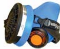
Particle half face respirator