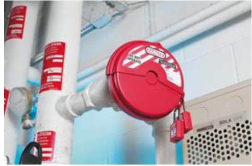
Valve lock and tag