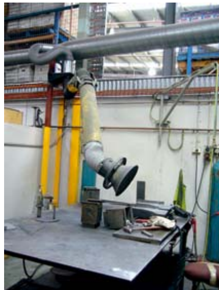
Welding fumes are extracted via flexible, locatable forced extraction and ventilation system.