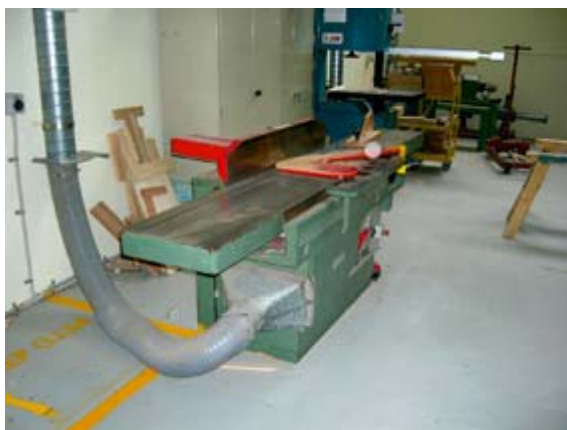
Woodworking dust generated by a buzzer is removed via forced extraction and ventilation.