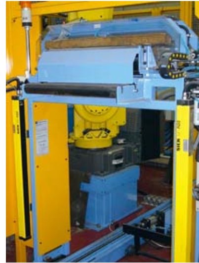
A light curtain used to disable the hazardous mechanism of a machine must resist failure and fault.