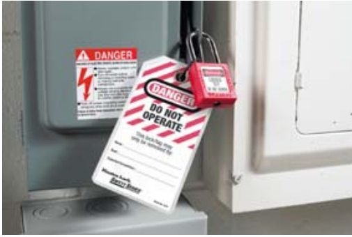
Tag and lock