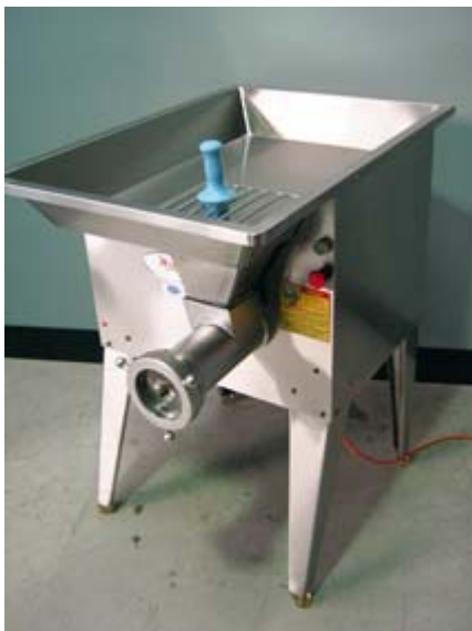
The narrow throat of the mincer prevents a person's hand from accessing the hazard.

Administrative controls, such as effective supervision, instruction and training, are required to ensure that only one key is available for the system, and the key is not removed from the access gate or guard by a second operator while a person is exposed to the danger area of the plant. Operations such as maintenance, repair, installation service or cleaning may require all energy sources to be isolated and locked out to avoid accidental start-up.